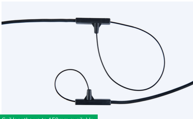
Coil lengths up to 150mm available